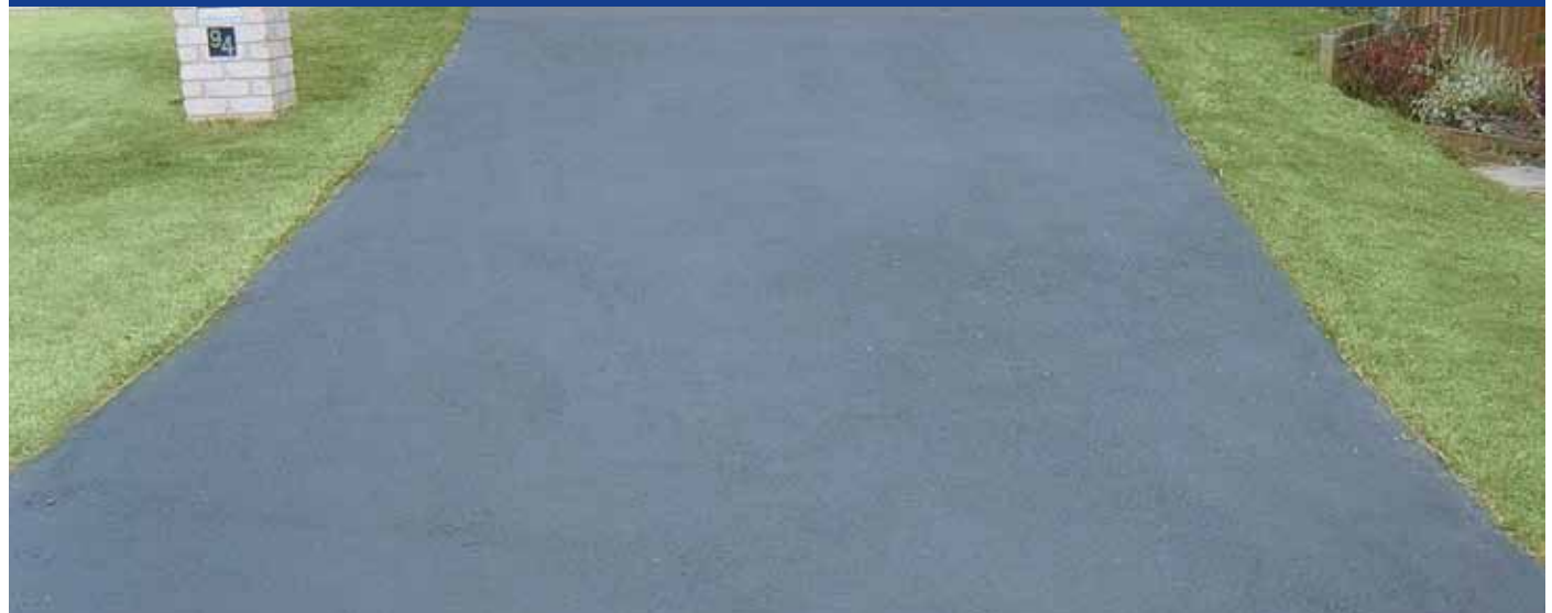
After - The driveway was cleaned and sealed with CCS Blue Grey Colour Master Sealer to bring it back to life!