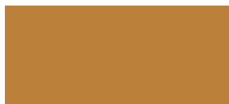
CCS Harvest Gold