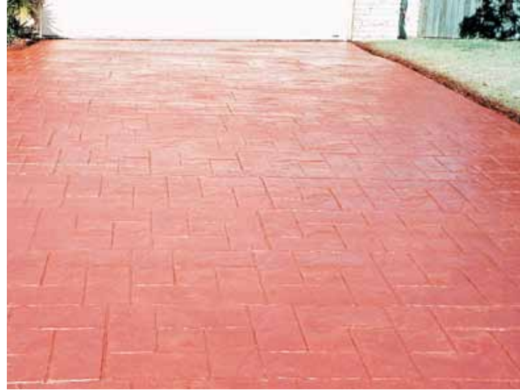
Revitalise existing concrete with CCS Coloured Sealer.