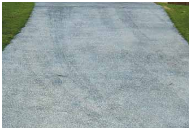
Before - This exposed aggregate driveway was never sealed and as a result, dirt, grime and tyre marks have accumulated on the surface.

Note: CCS Master Sealer also comes in a matt finish.